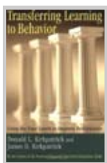
Transferring Learning to Behavior $ 39.95